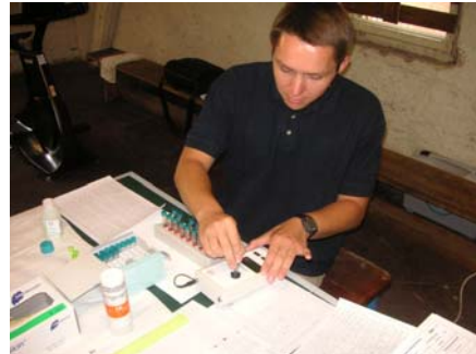
Reading of the lactate values