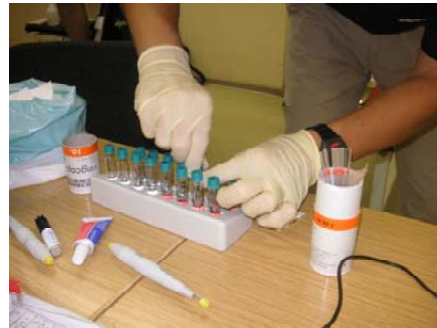
Samples in cuvettes