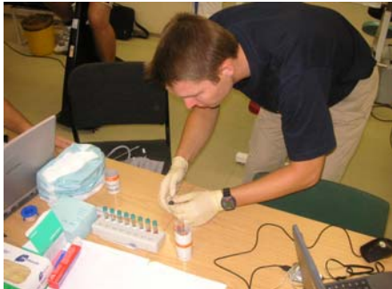
Testing place at the fire station